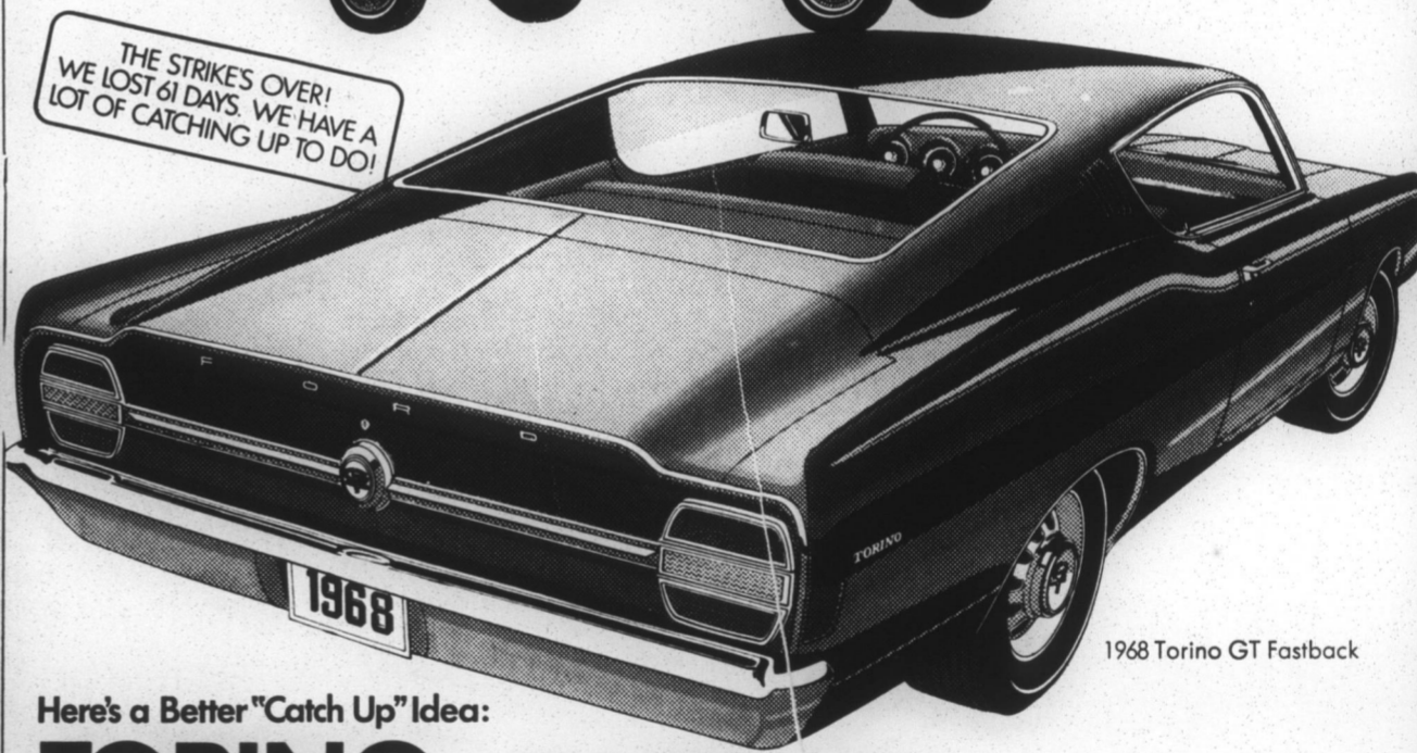
1968 Torino GT Fastback