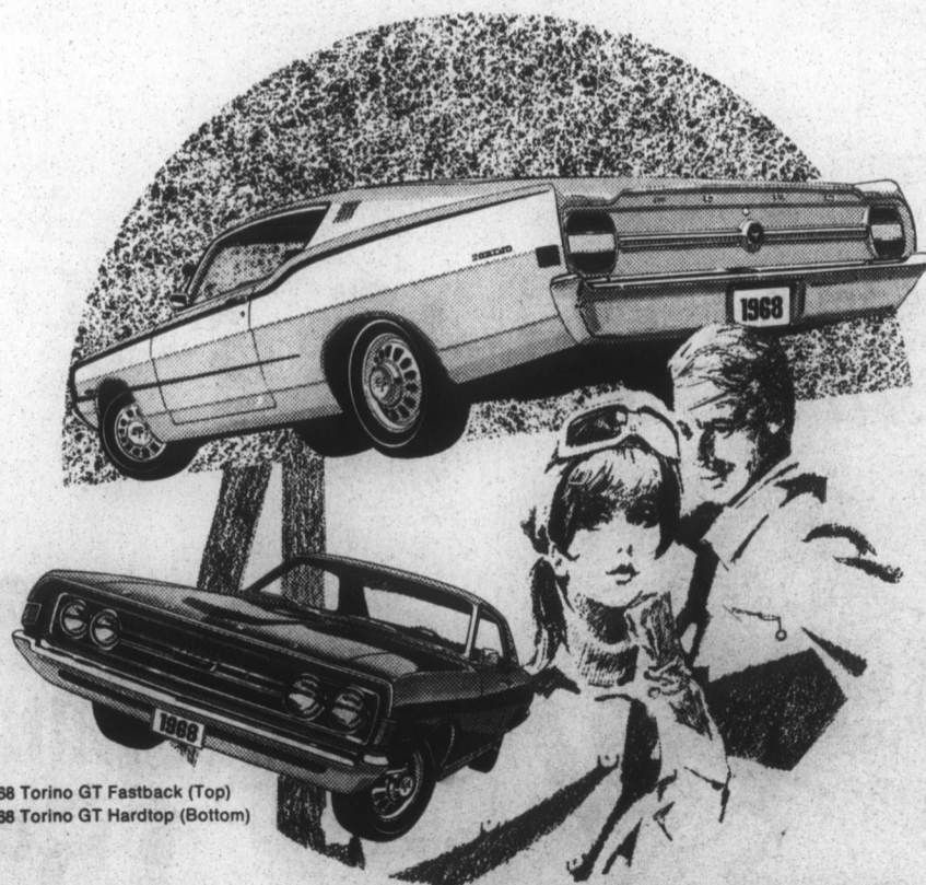
1968 Torino GT Fastback (Top) 1968 Torino GT Hardtop (Bottom)

Torino...for people who know there's more to a performance car than painted stripes.