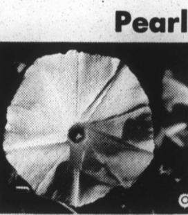
A morning glory of shining white which will bloom all summer long can grace your garden.

A powder room can be installed in a space as little as four-by-five feet, says the Plumbing - Heating - Cooling Information Bureau.