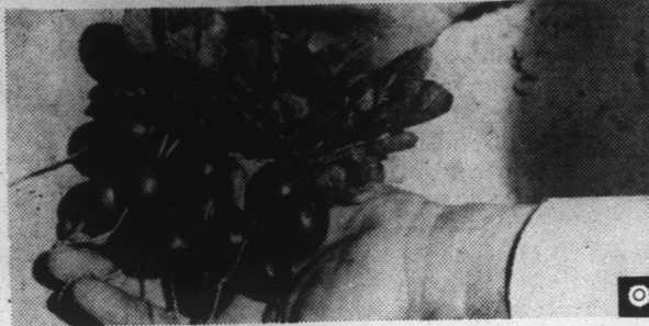
Cherry Belle is a popular radish, round and red, with crisp white flesh. It retains its eating qualities for a long time.