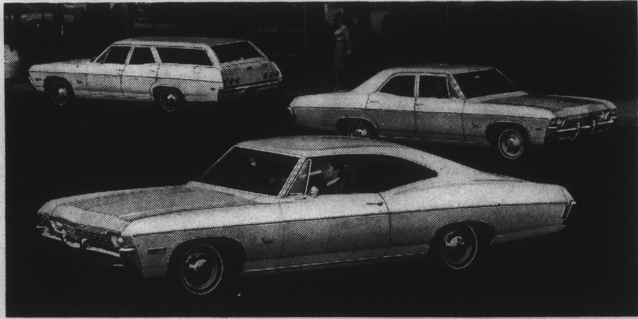
Impala Sport Coupe (foreground), 4-Door Sedan, Station Wagon