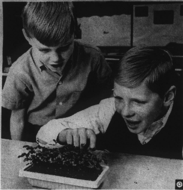
The slightest touch elicits an immediate response from a sensitive plant. Here seedlings are growing in a pre-planted container; can be potted later for house use or grown outdoors.

The most delicate touch of a fingertip on a single leaflet of a sensitive plant is sufficient to cause that leaflet to fold up in response.