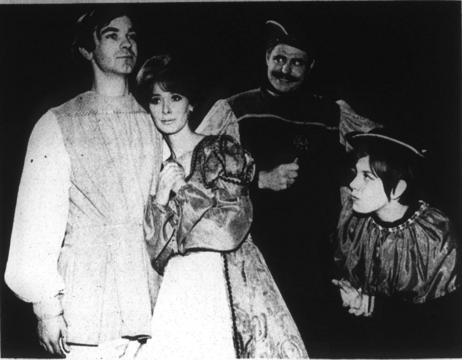
PERFORM HERE—Prince Worry and Princess Pam are captured by the wicked Lord Ogre and his accomplice, Weasel, in The Golden Sword , one of the plays presented Wednesday at Swain Elementary School by the Children's Theater of North Carolina. The play was for children in kindergarten through the third grade.