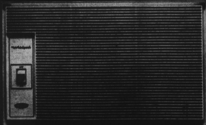
5,000 BTU carry-home model.