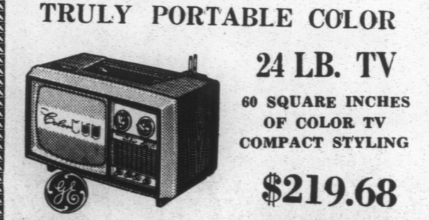
TRULY PORTABLE COLOR 24 LB. TV 60 SQUARE INCHES OF COLOR TV COMPACT STYLING $219.68

Buy Now At These Low Close Out Prices NO MONEY DOWN ON - OUR - EASY PAY PLAN!