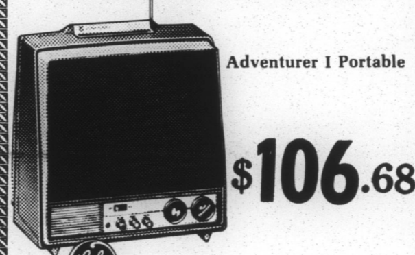
Adventurer I Portable