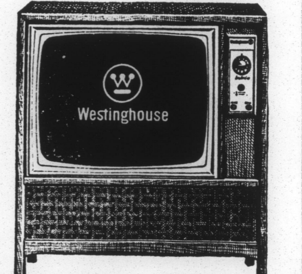
23" UPRIGHT INSTANT-ON CONSOLE $195.68

COMPARE WITH ANY MAKE FREE STAND Now Only . . . $134.68