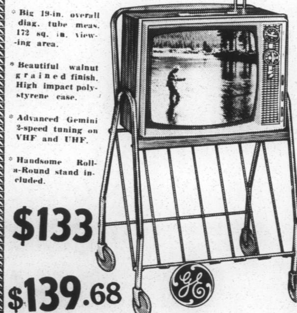
Big 19-in. overall diag. tube meas. 172 sq. in. viewing area.

Popular 12" overall diag. tube meas. 74 sq. in. viewing area. ULTRA-VISION prevents picture washout caused by glare from indoor and outdoor light. INSTA-VIEW . . . special circuitry keeps a low level of warmth in set at all times . . . picture and sound are almost immediate when set is turned on. Lengthens tube life too.