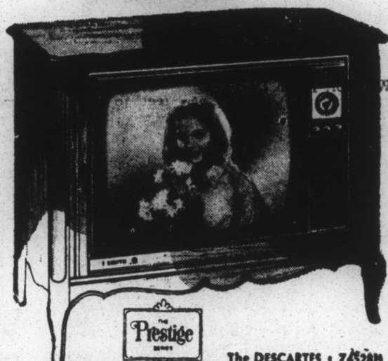
The DESCARTES • Z4528H Majestic French Provincial styled compact console in genuine Cherry Fruitwood veneers and select hardwood solids. Cabinet features cabriole legs, serpentine-shaped apron, and simulated tambour doors. Illuminated VHF and UHF channel numbers.