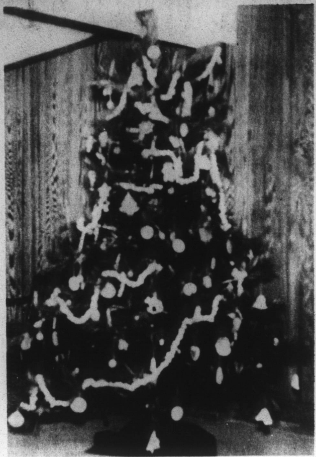
19th CENTURY YULE TREE

"Well, dear," said her aunt, "I dunno! If I had my time over again, I think I'd get married before I was old enough to have sense not to."