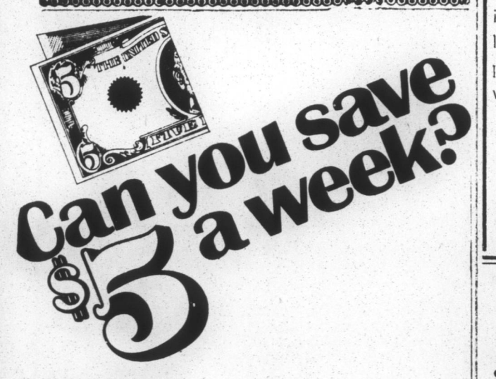
Figure It Up.

BRING US YOUR FILM FOR PROMPT PROCESSING