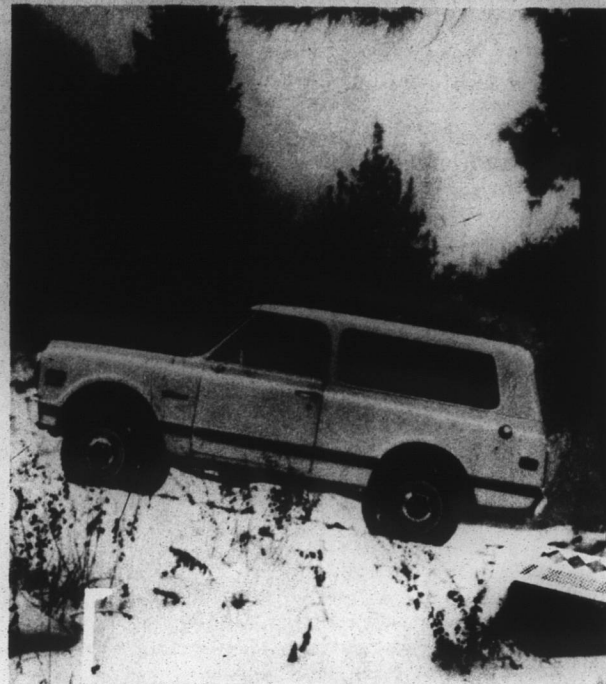
CHEVROLET BLAZER —Designed for both business and pleasure use, the Chevrolet four-wheel-drive Blazer combines high styling with a strong single-unit body on a durable 104-inch wheelbase chassis. Newest entry in the sports-utility market, it offers more power, higher load capacity, greater cargo and passenger space, wider road, and more comfort, convenience and appearance options than virtually all other such vehicles in its field. It is offered in six and eight-cylinder models with 155 and 200 hp.