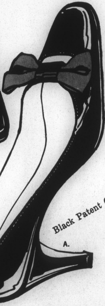
A. Black Patent Only