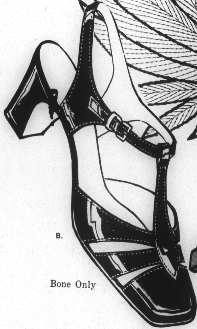
B. Bone Only