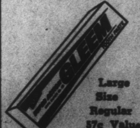
Large Size Regular 57c Value