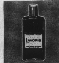
6-oz. Size Regular 75c Value