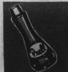
3.5-oz. Size Regular 50c Value