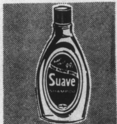
8-oz. Size Regular 59c Value

Your Choice of Favorite Toilet Goods Items 2 for $1.00