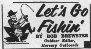
PICK OF THE PIG

This grows fast, has large leaves to keep off sun, and clusters of lavender flowers over a long period. If it does too good a job of shading, prune off a few leaves.