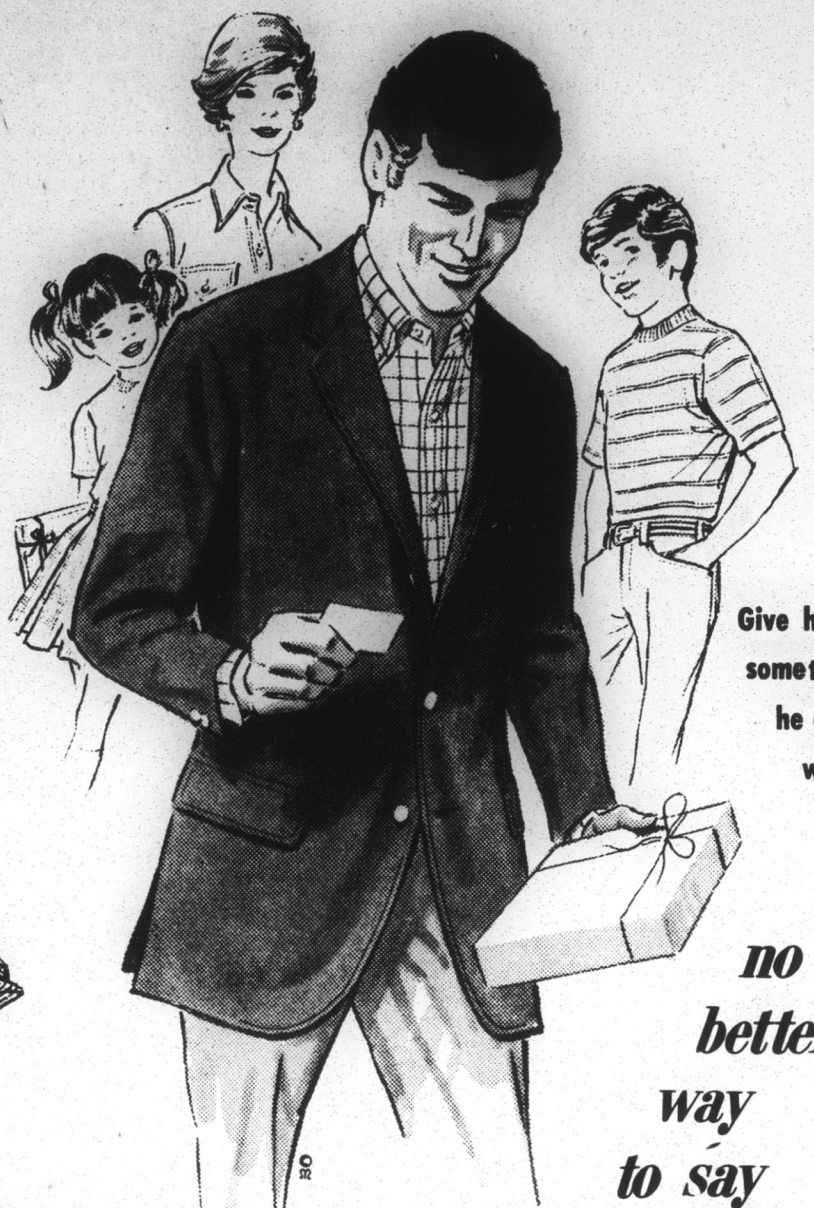
Give him something he can wear