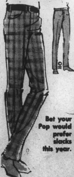
Get your Pop would prefer slacks this year.