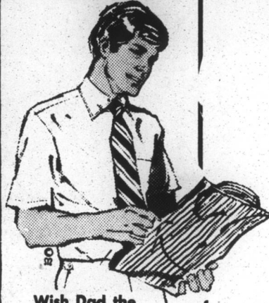
Wish Dad the best . . . give him dress shirts on his special day.