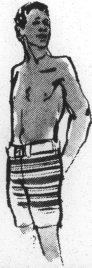
Dress the cool way all summer long.