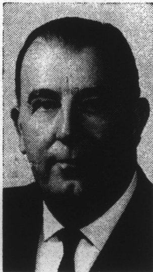
Sen. Jennings Randolph

staunch believer in providing a helping hand rather than a hand-out to those in need. His topic that evening will be "The Rebirth of Responsibility."