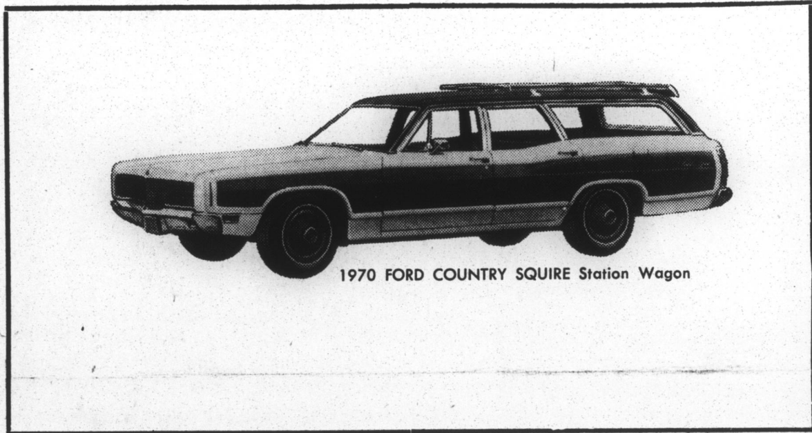
1970 FORD COUNTRY SQUIRE Station Wagon

- USED - Ford Motor Company Cars ★ LTD ★ Country Squire ★ Galaxie "500" ★ Fairlane ★ Mustang ★ Cougar ★ Mercury Hardtops - Sedans - Wagons Many With Factory Air And Warranty