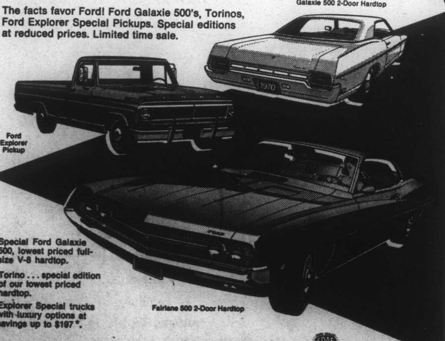
Special Ford Galaxie 500, lowest priced full-size V-8 hardtop.

The facts favor Ford! Ford Galaxie 500's, Torinos, Ford Explorer Special Pickups. Special editions at reduced prices. Limited time sale.