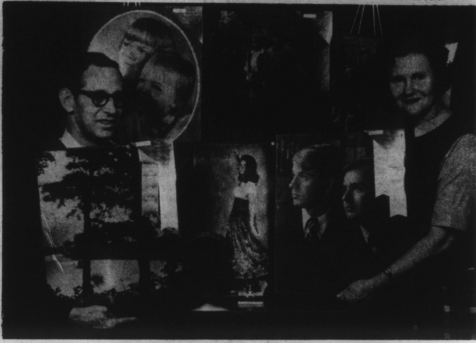
SUFFOLK PHOTOGRAPHERS WIN IN N. C. CONTEST