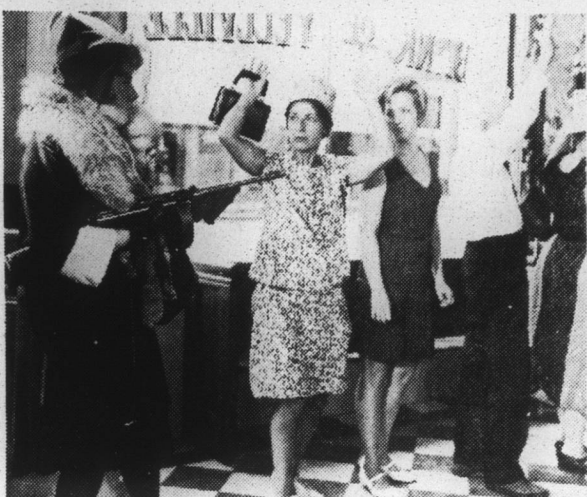
MA BARKER IN ACTION: Shelley Winters, portraying the infamous Ma Barker, holds frightened customers at bay during a bank holdup in American International's drama, "Bloody Mama." The film, depicting the wild crime spree of the Barker gang in the 1930's, begins an engagement on Thursday, (Friday and Saturday) April 1, at the Taylor Theatre.