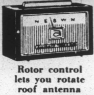
Rotor control lets you rotate roof antenna

SHOP AT SEARS AND SAVE Satisfaction Guaranteed or Your Money Back