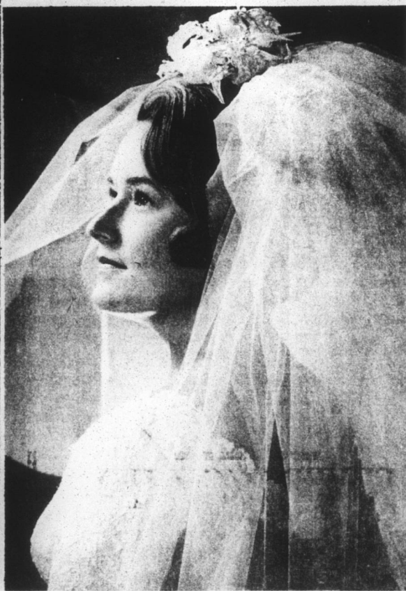
Another Fine Exhibition Print by