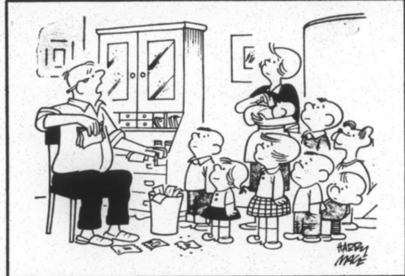
"I WANT TO ASK YOU ALL A BIG FAVOR - STOP EATING!"

Fill Cracks And Holes Better Handles the potty. Handles the wild. PLASTIC WOOD The Gluey - Accept No Substitutes.