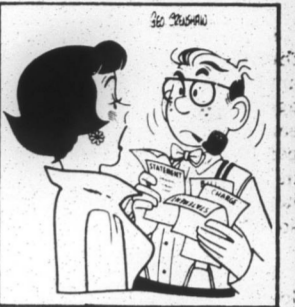
"I COULDN'T POSSIBLY BE SPENDING TWO THIRDS OF YOUR INCOME. YOU'RE NOT MAKING THAT MUCH."