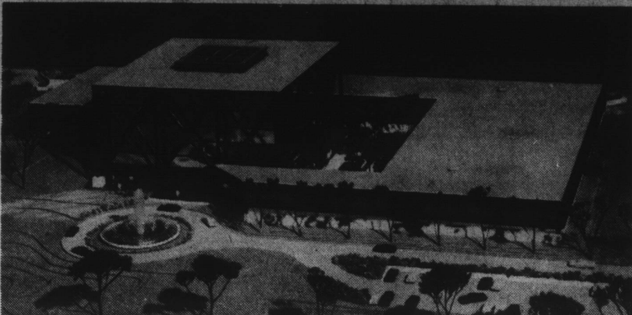
INTRICATE WOVEN STEEL —The Burlington Industries executive office building in Greensboro is an intricate pattern woven with steel. Exposed steel trusses weighing 300 tons each and surrounding the topaz-tinted mirror walls, shown in building model, give the structure the appearance of a glass cube suspended within a steel cradle. Fabricated from steel supplied from U. S. Steel, each of the 75 feet by 170 feet steel trusses was completely assembled in the Colfax plant of the Carolina Steel Corporation before shipment to the site for erection. The Charlotte firm of A. G. Odell, Jr., & Associates, designed the unusual building in which the floors are suspended from a steel roof frame.

You will note that prices this year are up six cents per pound above last year. In addition the incentive price for the 1970 crop is set at 72 cents per pound. Based on prices to date the incentive payment on this year's crop looks higher than the 1969 payments. Producers should turn in their receipts and file for the incentive payment promptly.