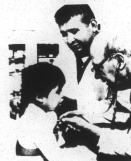
HOPE Comes Home

After ten years of medical training and treatment programs on four continents, Project HOPE has come home. HOPE has established health career training centers for America's disadvantaged in the Mexican-American community of Laredo, Texas and on the 16-million acre Navajo Indian reservation at Ganado, Arizona. Project HOPE—best known for the hospital ship S.S. HOPE, presently on a 10-month mission to Tunisia—is a private, non-profit corporation headquartered in Washington, D. C.