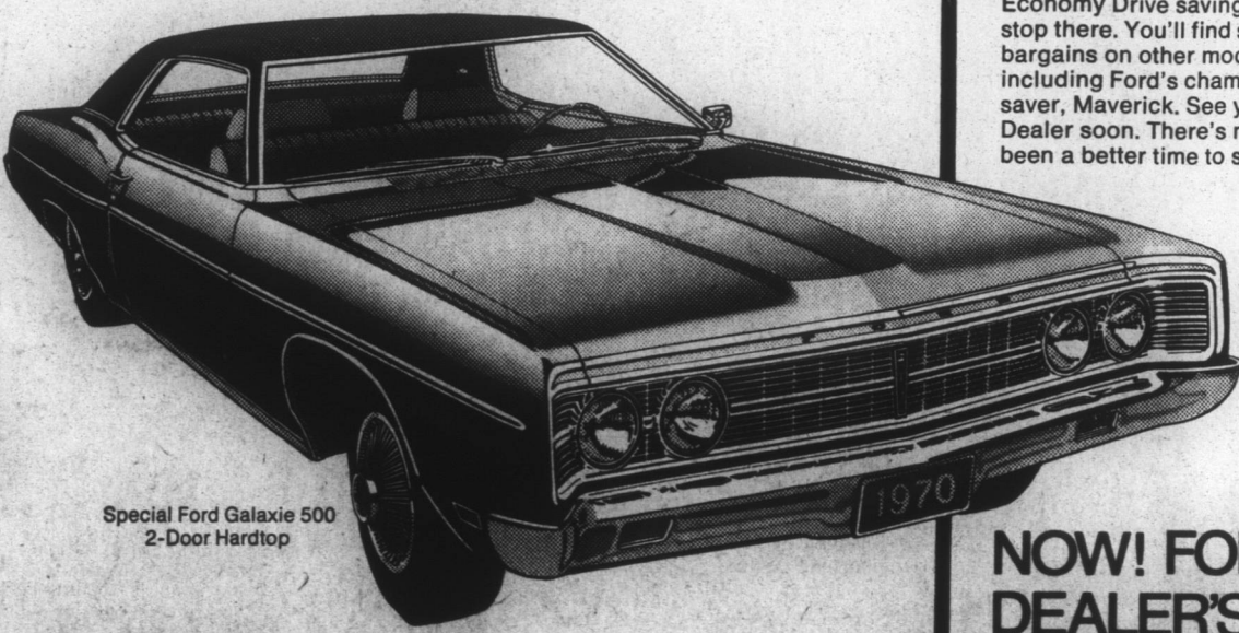
Special Ford Galaxie 500 2-Door Hardtop

We added a lot of extras to this big, quiet Ford ...and cut the total price $110.*