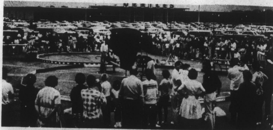
"JESSIE", The Wonder Elephant doing one of her stunts she puts on at each performance of the "FREE CIRCUS". Children are allowed to ride the back of this "Three Ton Charmer" between shows of the FREE CIRCUS.

Northside Merchants Will Be Open Thursday, Friday, and Saturday Nights Until 8:30 P. M