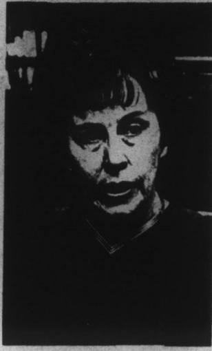
Mrs. Martha W. Griffiths

Rep. Martha W. Griffiths of Michigan, who will be the principal speaker at the banquet of the fall conference of Democratic women of North Carolina in Raleigh October 2, is the chief strategist in the recent passage by the U. S. House of Representatives of the proposed constitutional amendment to guarantee equal rights to women.