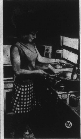
A holiday in the great outdoors needn't mean constant cook-outs. This homemaker, vacationing in a trailer, cooks Dad's daily catch of fish on a modern gas range fueled by LP gas.