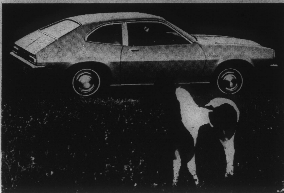
Pinto, Ford Division's frisky new little car, kicks up its heels with two engines, a 1600-cc. base powerplant and a 2000-cc. option. With "Pintopower" to spare, it excels at turnpike speeds and in tight passing situations. Small and light, Pinto gallops through the heaviest traffic and can wiggle into the tightest parking place. Ford dealers will introduce the '71 Pinto on September 11.

The Wise Owl Club of America, the eye-safety incentive program of the NSPFB, awards membership to industrial employees and students whose eyesight has been saved by wearing eye protection at the time of a potentially blinding accident.