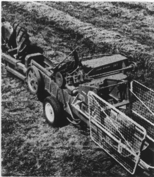
John Deere 24-T Twine-Tie Baler

If you are on a family-sized farm, a John Deere 24-T Twine-Tie Baler is the practical baler for you. It's a low-cost baler with big-baler benefits. For example, 24-T has all the capacity you'll ever need. Bales are neat, square-cornered, and tied to stay tied. Bale size is 14x18. Many safety devices protect the 24-T from damage. A jackstand is regular equipment. The long hitch gives you excellent maneuverability and better visibility of the pickup. It's a light-running baler, requiring a 2-plow tractor for most conditions. Come in and get the full story on the John Deere 24-T Baler. The Credit Plan makes it easy to own machines in The Long Green Line.