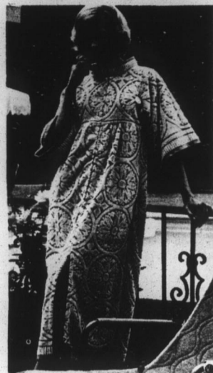
REGAL —Plush cotton terry in a sculptured jacquard weave creates a dramatic Empire-style robe. Elegant enough to double as a hostess gown, it's by Robes of California.

Of course, if they desire, they may enter into a second marriage between themselves.