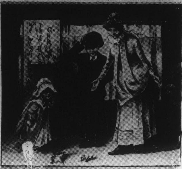
APPEALING FAMILY GROUP IS SUBJECT of the 1885 Louis Prang Christmas card shown here. Illustration of the mother marks trend of 1880's greeting cards, which often pictured attractive young women. This card is from the Norcross Historical Collection.

Mr. Prang, who published the best-known early greeting cards in the U.S., conducted a Christmas card competition. The $1,000 first