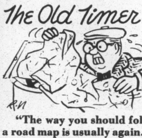
"The way you should fold a road map is usually again."

After all, the SST would transport passengers from America to Europe only two hours ahead of the time of travel made possible by existing commercial airplanes.