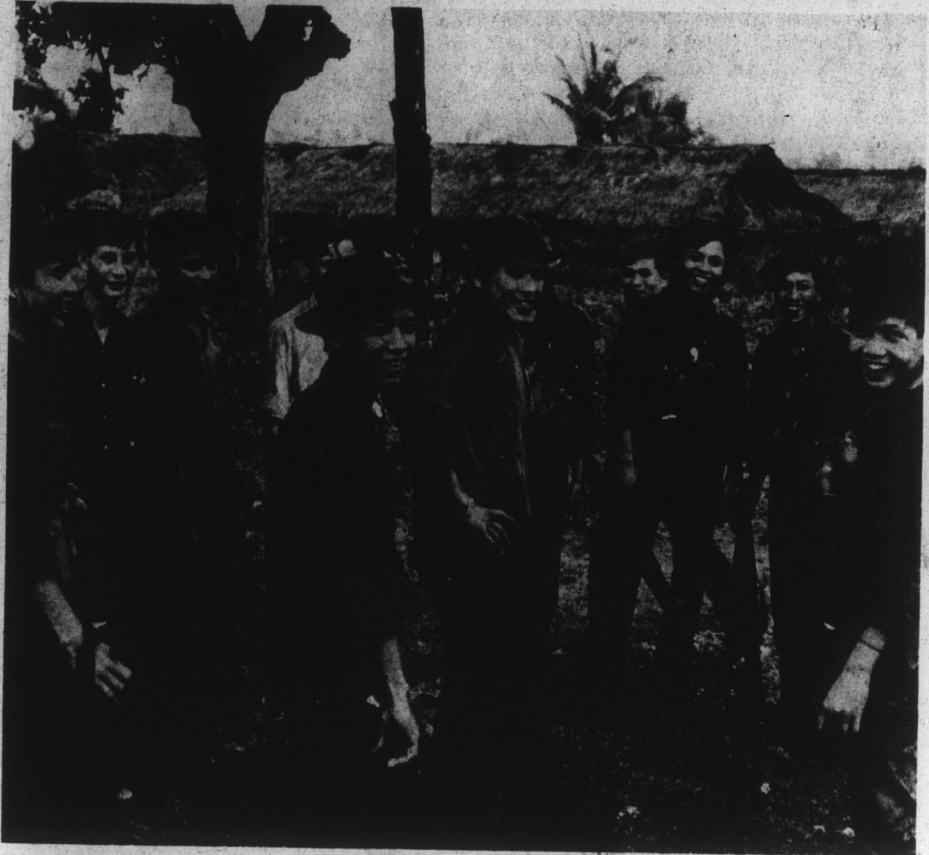
FORMER ENEMIES: A few months ago, these men were Viet Cong militia in an area that had been under communist rule since 1946. Now, re-armed and re-outfitted, they are fighting for the Saigon government. More than 200 of them, under their own leaders, came over to the government's side under the Chieu Hoi (Open Arms) program. The amnesty project employs advisors supplied by the U.S. Agency for International Development (AID).