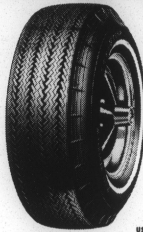
GOODYEAR — THE ONLY MAKER OF POLYGLAS™ TIRES