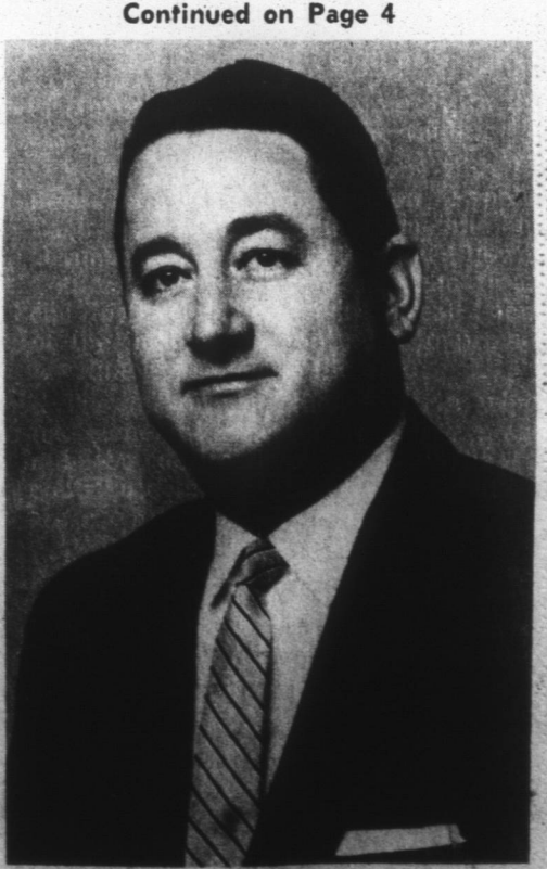
Rep. Phil Godwin