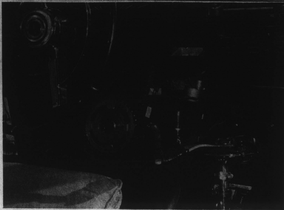
SPECIAL CONTROLS —This is the inside of the special-made car for Jarvis Belch to drive with no hands. Steering is possible with the use of a bicycle sprocket with a special slip-on-and-off shoe. Jarvis is also able to blow the car horn and give turn signals with the use of his legs.

"With Us Service Is A Profession Not A Sideline"