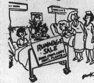
"She's being released today, so why not?"

— FOR — FILL DIRT AND TOP SOIL — CALL — LAYTON AND WILLIAMS ROUTE 1, EDENTON, N. C. Phone 482-4257 or 482-4230