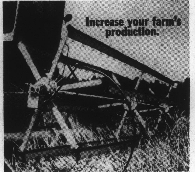
Increase your farm's production.

The replacement of old, worn-out machinery is vital to your farm's productivity. If you need credit for new equipment, see your Production Credit Association.