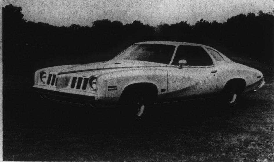
NEW SPORTY GRAND AM —Topping the Pontiac intermediate line for 1973 is the stunning new Grand AM, which incorporates classic styling with unique ride and handling characteristics. A "soft-nose" front end design uses flexible molded urethane which deflects but returns to original shape after being impacted at parking lot speeds in much the same way as a rubber volleyball. New models are now being shown.