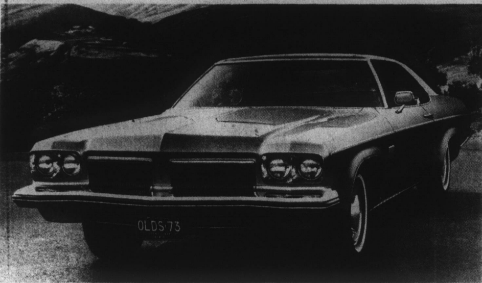
NEW OLDS —Oldsmobile Division's 1973 lineup features a new compact car, completely redesigned Cutlass models and a long list of engineering advancements. The new models are at dealer showrooms this week. Pictured above is the Delta 86 Royale hardtop coupe.