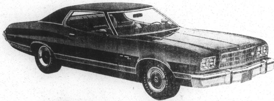
GRAN TORINO SPORT 2-Dr. Hardtop

Friday, September 22nd FREE GIFTS - FAVORS FOR CHILDREN