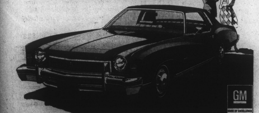
(above) Caprice Coupe. Our new uppermost Chevrolet. Its luxury, comfort and quiet ride rival the most expensive cars you can buy. (below) Monte Carlo 3 Coupe, America's newest road car. With the handling of the finest European cars, and the looks and comfort of an American car.