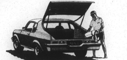
New Nova Hatchback Coupe.

models. Nineteen different models to choose from.