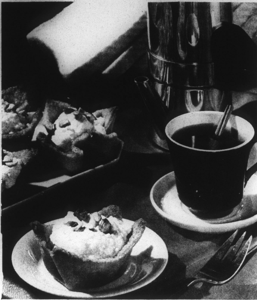
DAY OF BREAD —Go international with Quick Cannoli for dessert in observance of Day of Bread Tuesday, October 3, at the beginning of Harvest Festival Week. If your family prefers a sweeter dessert substitute a pudding or pie mix for the cheese mixture.