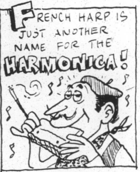
FRENCH HARP IS JUST ANOTHER NAME FOR THE HARMONICA!

Add sliced bananas to favorite cereal, cooked or ready-to-eat.