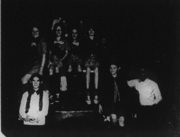
Junior Girl Scouts Visit National Guard Armory