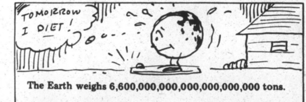
The Earth weighs 6,600,000,000,000,000,000 tons.

Life doesn't mean for you to go your way and God go His. Suppose God went His way and left you alone and didn't care. There would be no chance for life in Heaven. Life is a gift from God. God loves you, so why not let Him know you appreciate it. Just take a little time and thank Him. God loves you, so why go Satan's way? You have a choice, God or Satan. Remember, friend, "God is Love." Satan is trouble.