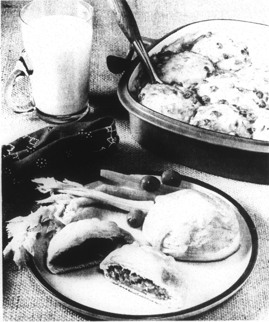
QUICK 'N EASY —An interesting variation of the old favorite—tuna casserole—Tuna-Cheese Biscuit Bake might be favored by your family. Corned-Beef Hash Burgers could be the main dish for a cool night supper or as a party snack for the young ones.

Finely chop ham or canned luncheon meat into your next batch of pancake mix. Serve your hot pancakes topped with hot apple sauce. Complete your quick dinner with a vegetable or tossed salad and a beverage.